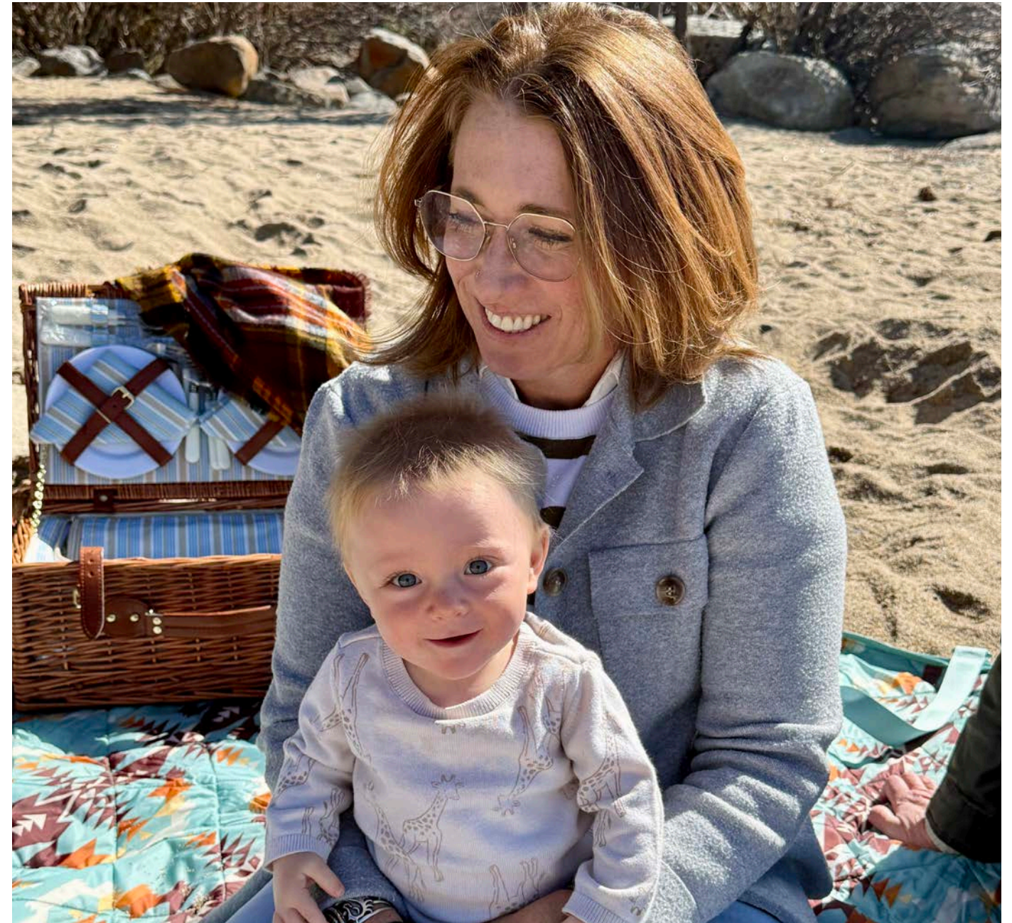
Photo featuring Tahoe's future generation